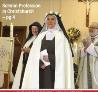
'PUBLICATION OF THE YEAR' - ARPA AWARDS 2020

NZ Catholic are providing, free of charge, a digital link to the latest issue.