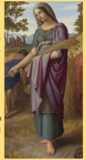
Julius Schnorr von Carolsfeld (1794-1872)

We will explore the lives of key women in the Bible who chose unconventional methods to bear important leaders: women in Genesis, Exodus, Joshua-Judges, Ruth, Esther and Judith.