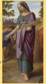
Julius Schnorr von Carolsfeld (1794-1872)

We will explore the lives of key women in the Bible who chose unconventional methods to bear important leaders: women in Genesis, Exodus, Joshua-Judges, Ruth, Esther and Judith.