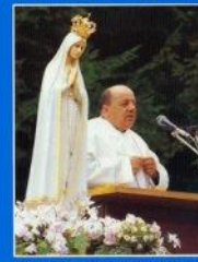
The Marian Movement of Priests